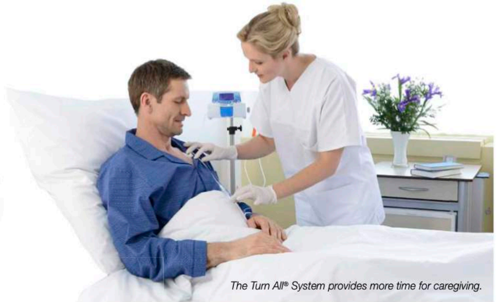
The Turn All® System provides more time for caregiving.