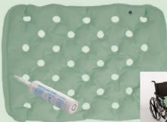
4250B Bariatric Cushion incl. LAD pump